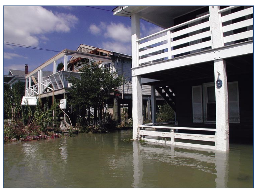
Select building materials that can endure periodic flooding.