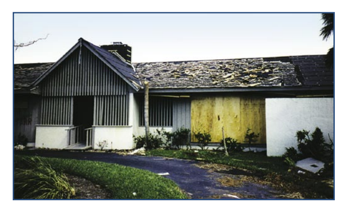
Select building materials that are suitable for the expected wind forces.

Use hot-dipped galvanized or stainless steel hardware. Reinforcing steel should be protected from corrosion by sound materials (masonry, mortar, grout, concrete) and good workmanship (see Fact Sheet No. 16). Use