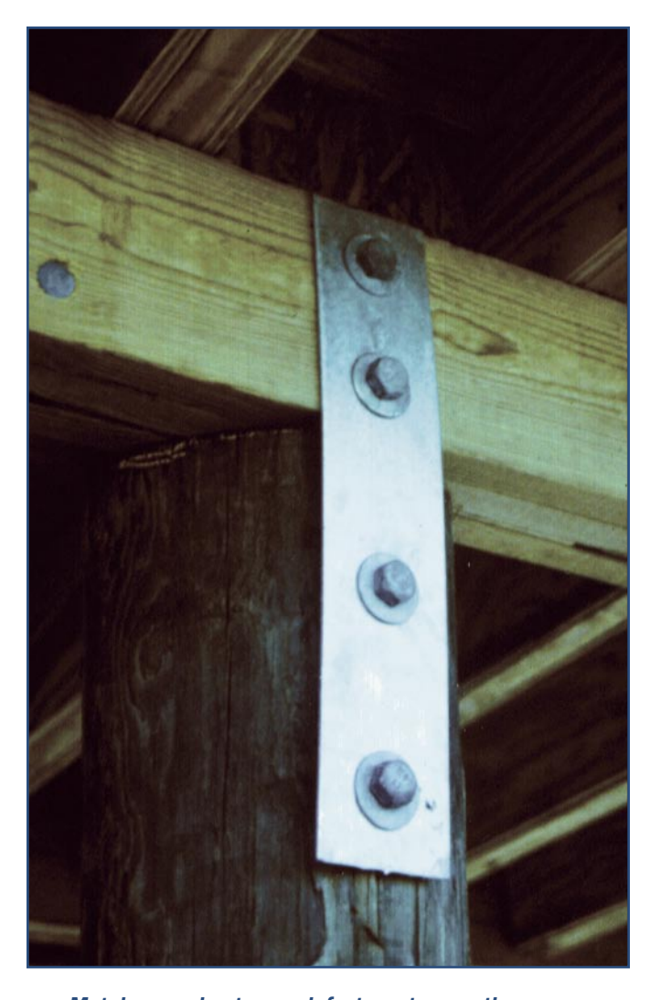
Metals corrode at a much faster rate near the ocean. Always use well-protected hardware, such as this connector with thick galvanizing. (For information about pile-to-beam connections, see Fact Sheet No. 13).

Wood decay at the base of a wood post supported by concrete.