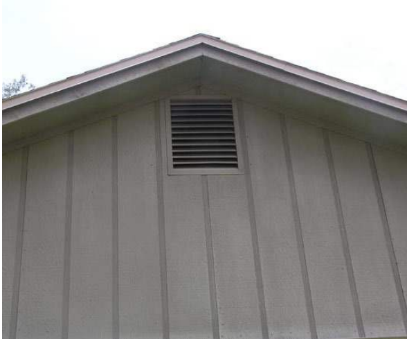
Figure 3.4. Shuttering of gable end vent from inside attic