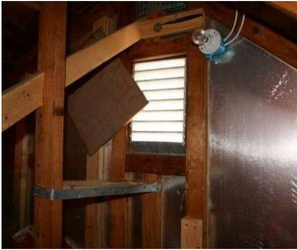
Figure 3.2. Example of a gable end vent

Gable end vents must have removable shutters in accordance with FORTIFIED Standard Detail F-GS-1 "Gable Vent Shuttering" (refer to Appendix A), and homeowner must be made aware that installation of shutters is temporary and that shutters must be removed once the hurricane threat has passed.