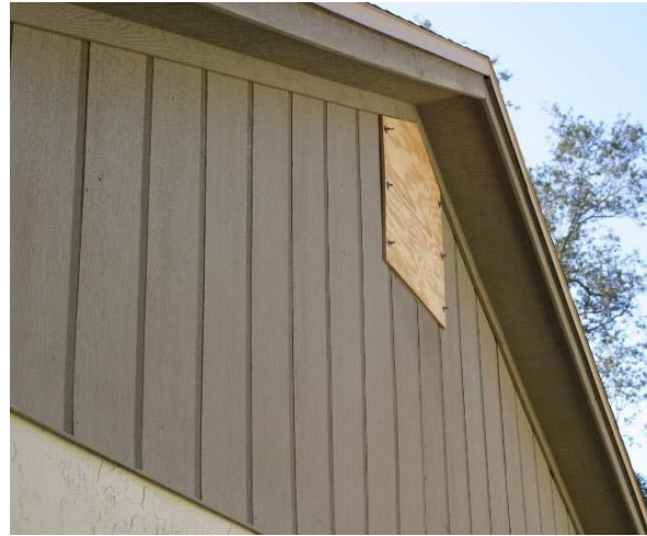
Figure 3.3. Outside shuttering of a gable end vent with Plywood